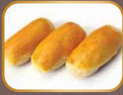
Tart Gulung Kurma