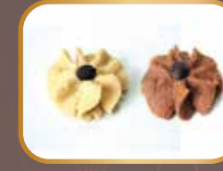
Dahlia - Vanilla & Choc