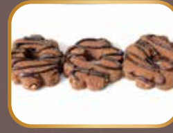
Top Tella Nutty