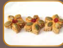
Sunflower Oats Cookies