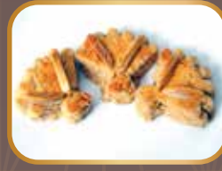
Nestum & Oats Cookies