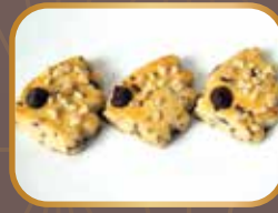
Choco Almond Crunch