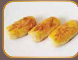
Pineapple Cheese Tart