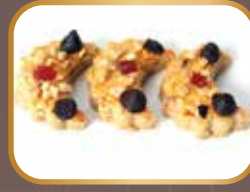
Quaker Oats Cookies