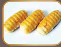
Tart Gulung Nenas