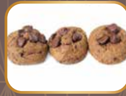
Choc Chip Cookies