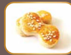
Cheesy Peanut Cookies