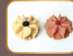
Dahlia - Vanilla & Strawberry